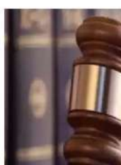
AHMEDABAD: The Gujarat high court has ruled that an engineer working in a capacity of supervisor cannot be treated as a workman and his case cannot be heard by a